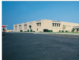
Fort Wayne, Indiana, USA