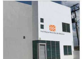
Querétaro, Qro. México