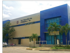
Metro Manila, Philippines