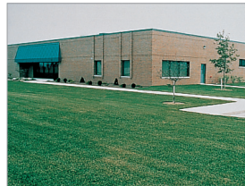
London, Ontario, Canada