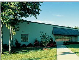
Columbus, North Carolina, USA